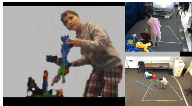
Figure 2. The boy is using a dinosaur to destroy a Lego tower his father built. The father stands outside the capture area and takes pieces off to complete this illusion.

Engagement. The OneSpace setup seemed to encourage a more engaged co-operative and organized play, where both participants would take on an active role in structuring the play with one another. Since participants’ actions would have visual consequences in the shared video scene, this would tend to stimulate additional discussion and action. Figure 2 provides an illustrative example of G3, where the child and the father have set up a scene where the blocks (set up by the father) are now being virtually destroyed by the child’s dinosaur. The father stands out of the “visible” area, and responds to the child’s movements by taking apart various parts of the tower. Here, both the father’s and son’s actions in their independent physical spaces is entirely